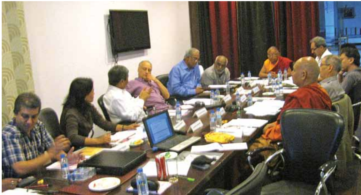
Meeting of the Working Group set up by the IBC Governing Council in progress.

The other areas for discussion were planning new activities, use of IBC logo, creating awareness about IBC, Buddhism as a part of the secular curriculum in education, membership and chapter formation, setting up a directory and the UN Day of Vesak celebrations.