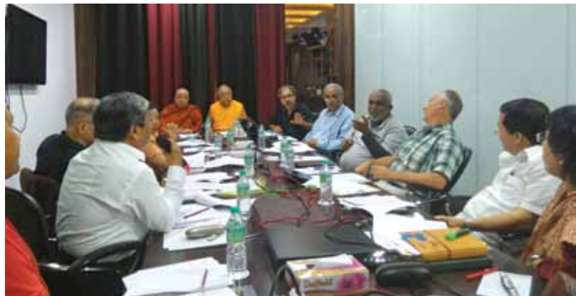
Members discussing at the Working Group meeting at New Delhi

The two-day Working Group Meeting was held on September 1-2, 2015, to discuss the proposed amendments to the IBC Constitution. Members were informed that IBC is organising an “International Seminar on India’s North Eastern Region and Buddhist Heritage – Bridge between South and South East Asia” in December 2015.