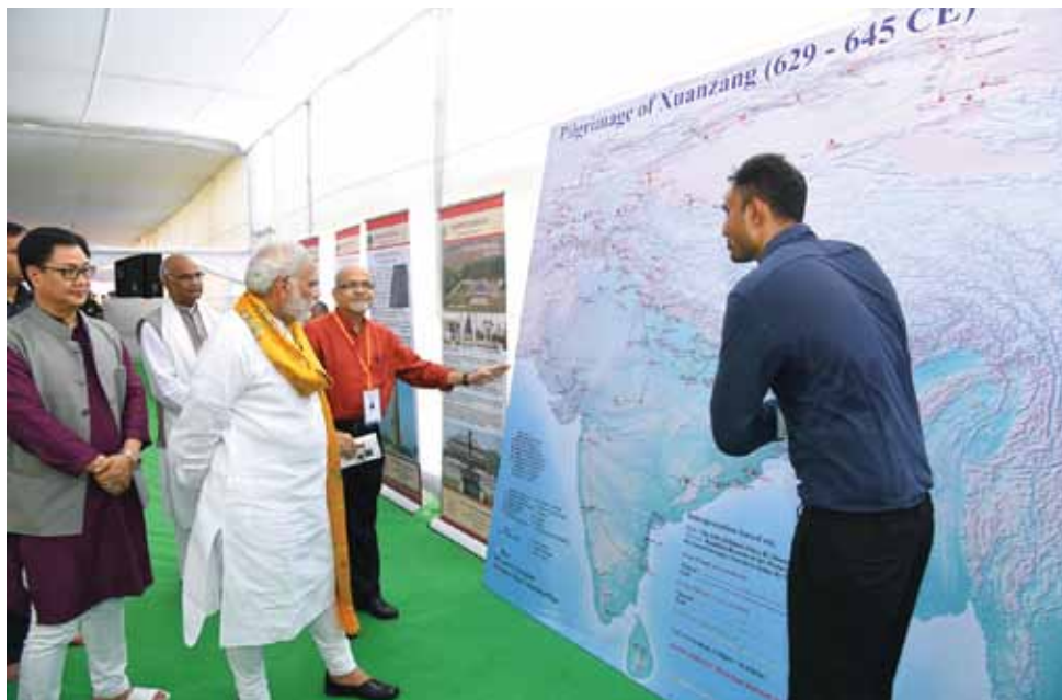
Prime Minister Narendra Modi being shown the map at the exhibition depicting Xuanzang's pilgrimage. Also seen are Union Minister of State for Home Affairs Kiren Rijiju and Director of the Nava Nalanda Mahavihara, Dr Ravindra Panth.

The highlight of the exhibition was a detailed map showing the entire pilgrimage route of Xuanzang. The map was prepared on the basis of the ' Biography ' and the ' Journey to the West ', the two works of Xuanzang. Exhibits included digital photographs, books, art and handicrafts.