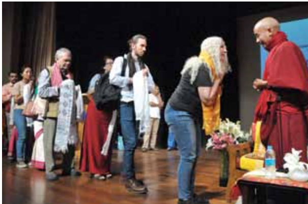
Followers queue up to take blessings from Yongen Mingyur Rinpoche (above); the crowded auditorium (below)