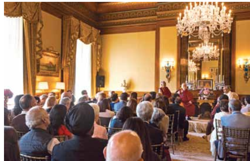
His Holiness the Dalai Lama speaking to Indian business and political leaders at the talk organised by the Hinduja Foundation on September 20, 2015.