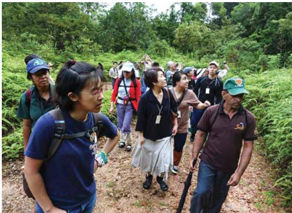
INEB Conference participants went on two separate study tours where they interacted with each other to learn about the issues