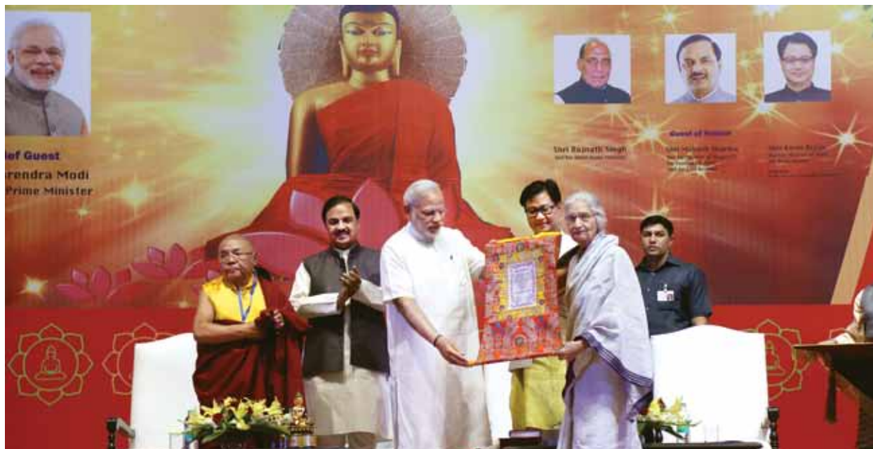
Prime Minister Narendra Modi presenting a scroll to Dr. Kapila Vatsyayan

the Government was committed to building a grand Holy Relic Vihara in Delhi to consecrate the Kapilavasthu relic currently housed in National Museum, New Delhi.