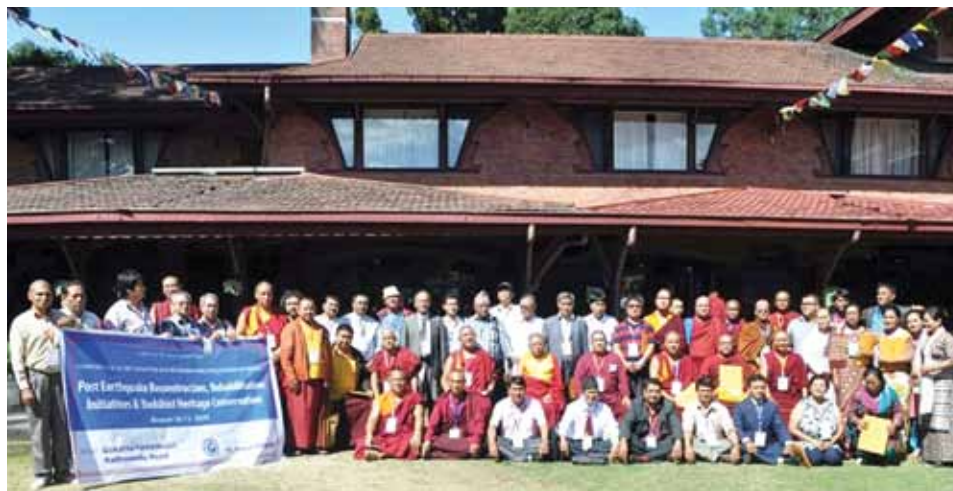
Participants at the conference organised by IBC Nepal Chapter and Buddhist organisations of Nepal on Post-Earthquake Reconstruction, Rehabilitation Initiatives and Buddhist Heritage Conservation.

also representatives from the three traditions– Theravada, Mahayana and Vajrayana–making it a 10-member group.