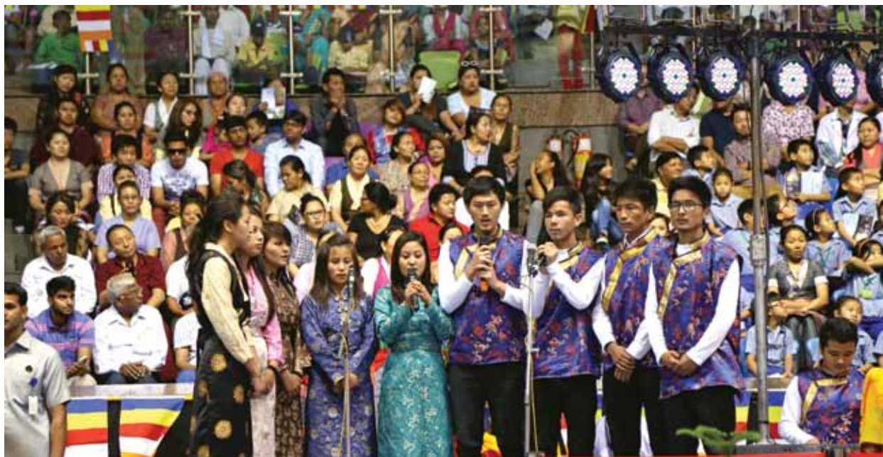
The choir of the Mahabodhi Higher Education School, Chandigarh, singing during the cultural programme at Talkatora Stadium, at the International Buddha Purnima Diwas Celebrations 2015 in New Delhi.