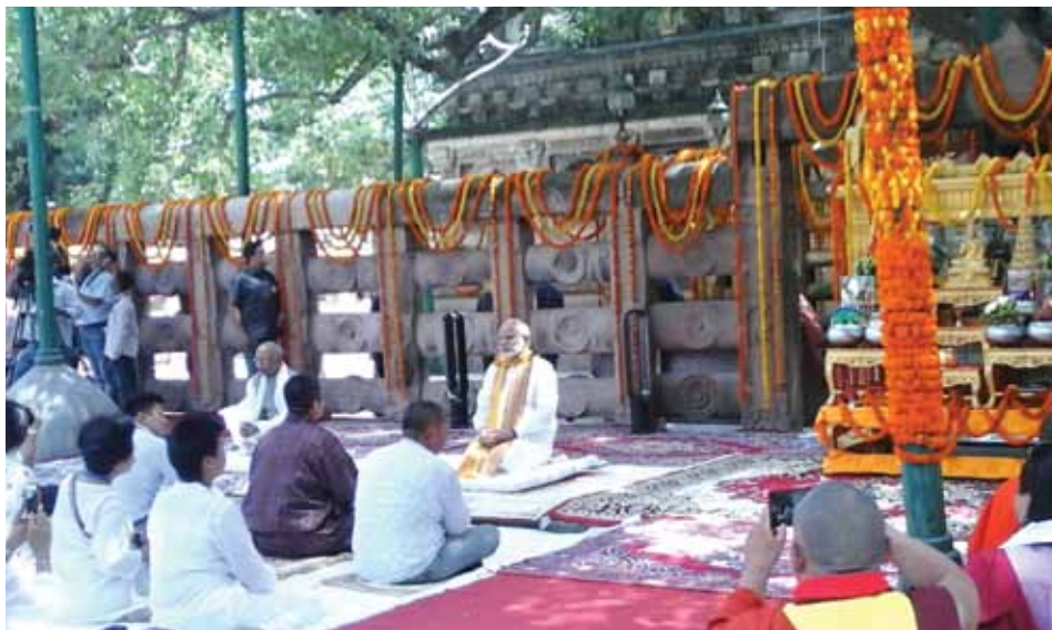
PM Narendra Modi joins the Sangha in offering prayers under the Holy Bo Tree in Bodhi Gaya.

On September 5, the last day of the International Conference, all the national and International