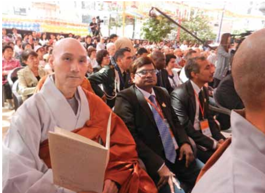
IBC delegation from India took part in the 'Conference on World Peace and Reunification of Korea' organized by the Jogye Order of Korean Buddhism.